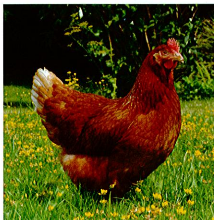
The Novogen Brown.

With an increasing number of worldwide production systems, all breeding companies have to demonstrate their breeds can perform under different conditions. Novogen recognises the need for ease of management and good behavioural characteristics under different systems giving versatility to